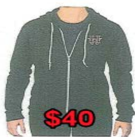
Ladies Full-Zip Hoodie